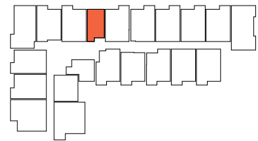
Level 2 – Level 6