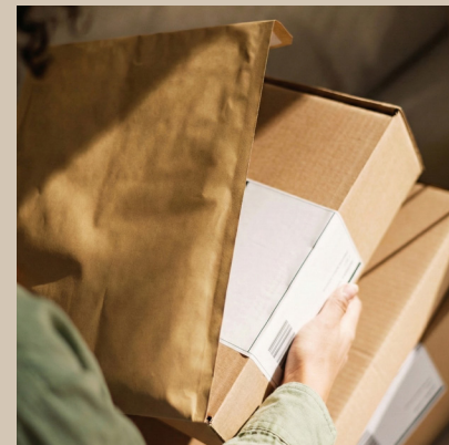
The Parcel Room: Secure storage to keep packages safe.