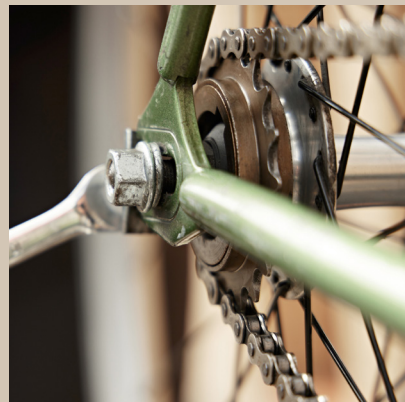
The Spoke: Repair and wash facility to keep your bike ready to go.