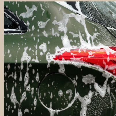
The Shine Shop: Skip the drive-through lineup and use the on-site car wash bay instead