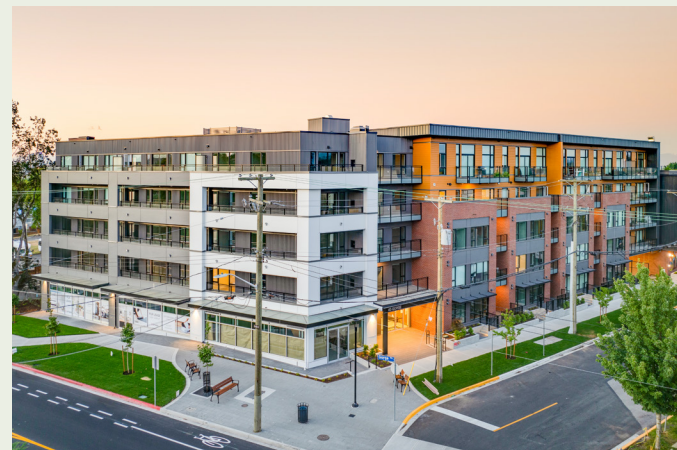
The Gorge Victoria, BC