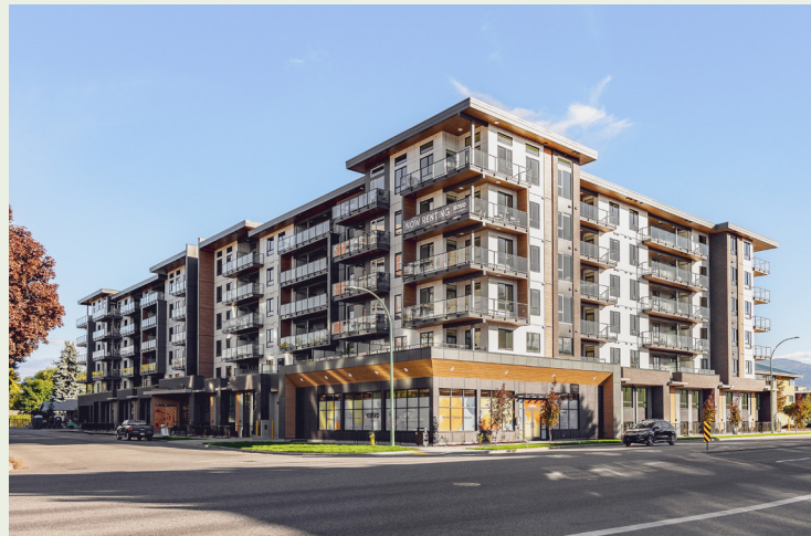
KOVO Kelowna, BC