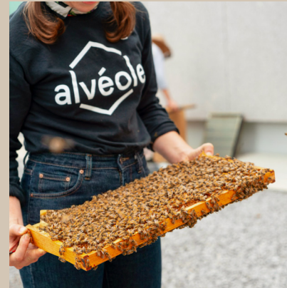
The Hive: Rooftop beekeeping by Alvéole provides a sweet perk for residents and a welcoming home for local pollinators.