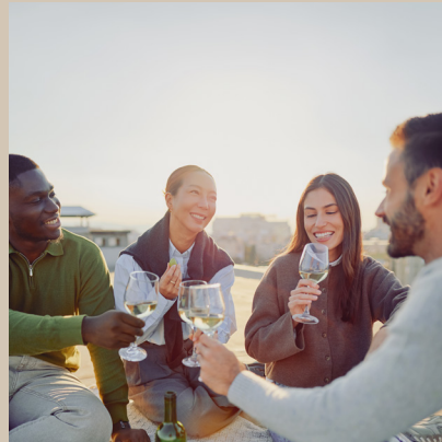
The Perch: An indoor-outdoor kitchen and lounge with alfresco seating, BBQ stations, community garden, billiards table, big-screen TV, and Nespresso machine.