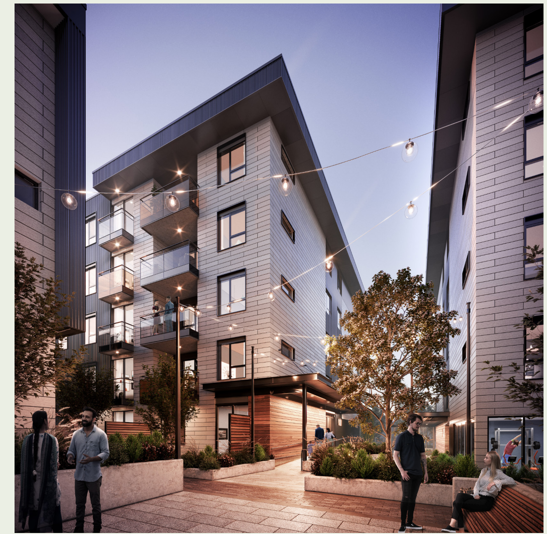
AT GROUND LEVEL, THE YARD FEATURES A TODDLER PLAY AREA, DOG RUN, AND THE PULSE FITNESS STUDIO.