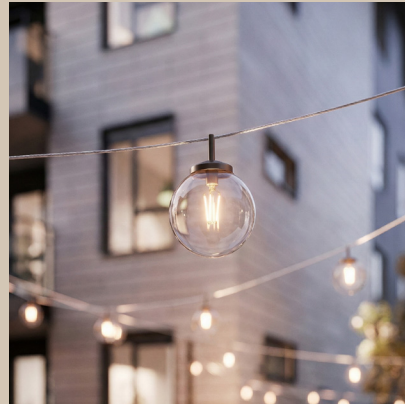
The Yard: Features a toddler's play area and a dedicated dog run, offering a welcoming outdoor space for families and pets.