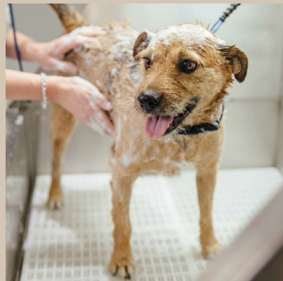
The Spaw: Pet wash facility for quick and easy grooming, keeping four-legged friends clean and fresh.