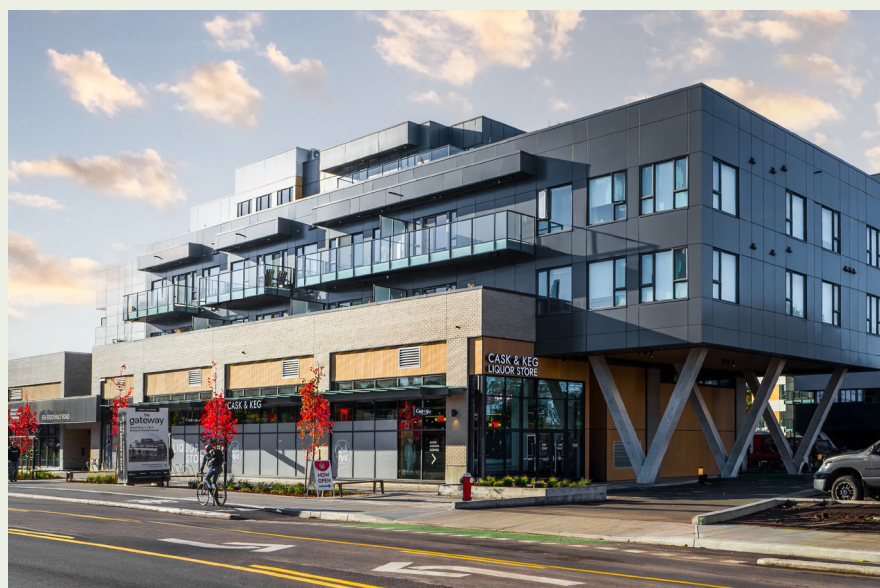
The Gateway Esquimalt, BC