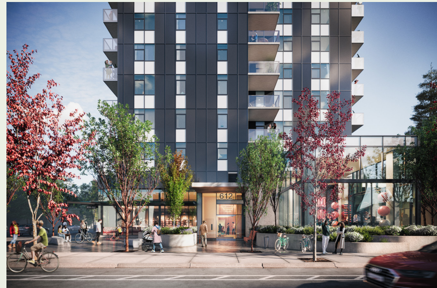
Uptown West New Westminster, BC