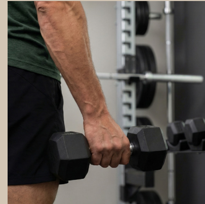
The Pulse: A fully equipped gym with cardio and weight training equipment to keep your workout routine close and convenient.